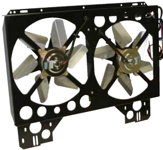
FRONT VIEW 19510 Shown

PLEASE READ ALL OF THE INSTRUCTIONS BEFORE BEGINNING INSTALLATION OF THIS SYSTEM